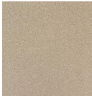
ALYA 7246 2/3/4m 100 cm x 100 cm