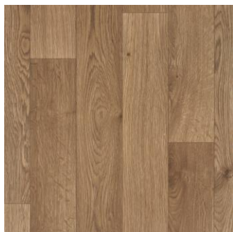
FALCO 3959 2/3/4m 100 cm x 100 cm