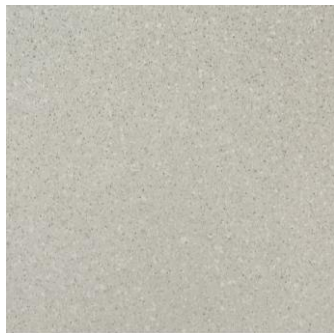
ALYA 6046 2/3/4m 100 cm x 100 cm