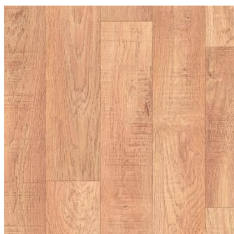
BARON 1127 2/3/4m 100 cm x 100 cm