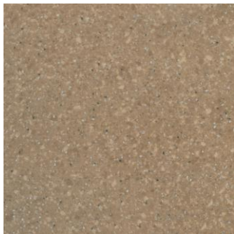
ALYA 3646 2/3/4m 100 cm x 100 cm