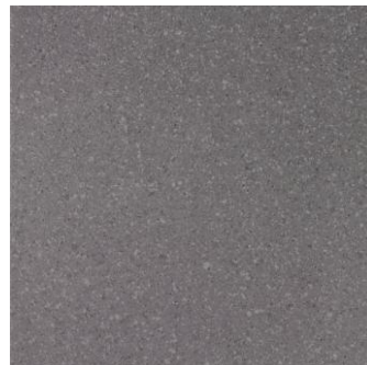
ALYA 8046 2/3/4m 100 cm x 100 cm