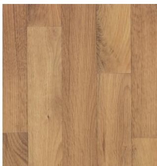
MARRON 1240 2/3/4m 100 cm x 100 cm