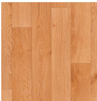
FALCO 1759 2/3/4m 100 cm x 100 cm