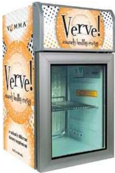
HCT-200 - 70 can capacity