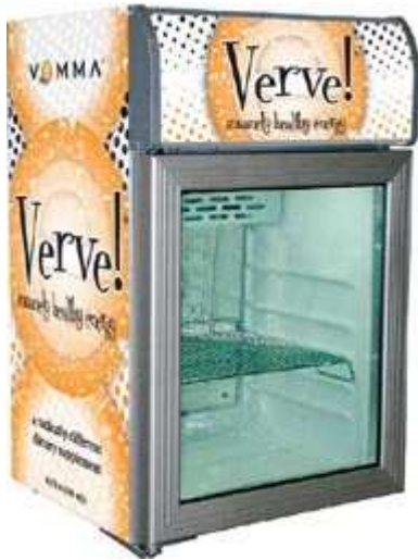
HCT-50 – 24 cans VERVE capacity