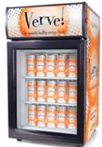
HCT- 100 100 can capacity